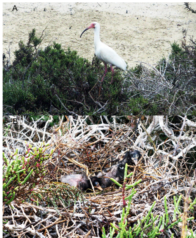
Figure 2. Nest of White Ibis: (a) shows an adult beside the nest, and (b) shows the nest with two chicks.

Guerrero Negro is one of the most important sites for waterbirds in the Baja California peninsula and one of the most relevant in México, both during migration and wintering periods (SEMARNAT, 2008; Carmona et al. ,