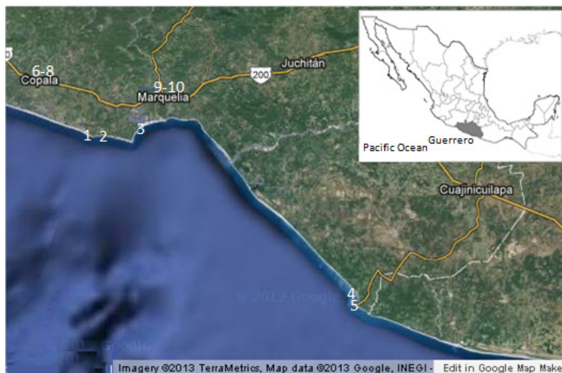
Figure 1. Location of sampling stations (1–10) in the southern part of the Costa Chica, Guerrero coastline surveyed from July 7 through December 15, 2010.

Sea surface temperature ranged from 27.6 °C (February) to 30.5 °C (July) and showed a clear marked seasonal pattern (Fig. 2). Blooms of P. bahamense var. compressum occurred during the highest summer temperatures recorded in July (30.5 °C), indicating its subtropical and tropical nature. Pyrodinium bahamense